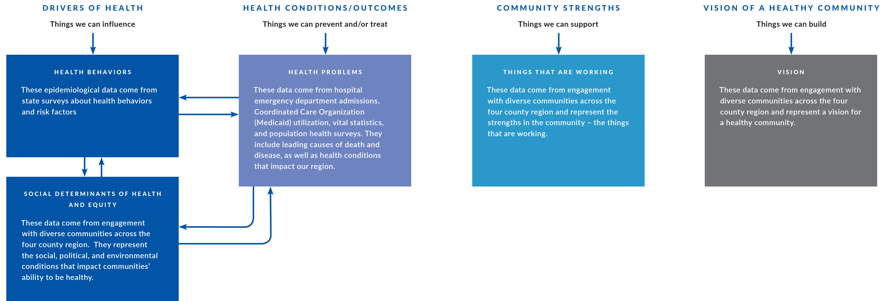
Figure K-1: Priority Health Issues Model for Washington County

The data in this model come from different sources with different methods, research questions, and prioritization processes. The second page discusses specific sources and limitations. For more information on methodology, sources, and limitations, see the Health Status and Community Themes and Strengths assessments.